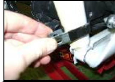
Fig. 4 Left Side