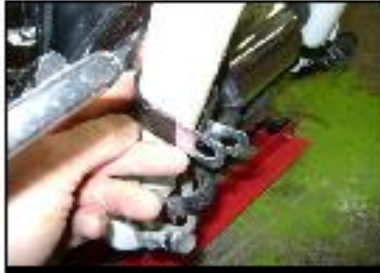
Fig. 3 Right Side