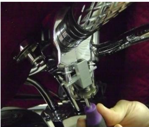
Step 3 & 4: Install the screw from step 1 into the counter sunk hole on the cruise block. Holding the cable stay in place, install the screw and cruise unit on to the switch housing.