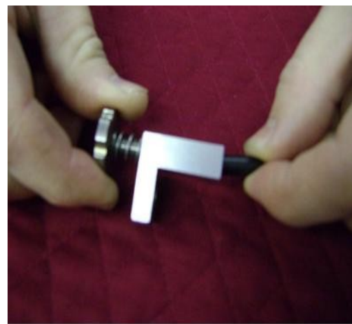
Step 2: Select the proper rubbing block and install into the cruise block