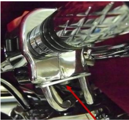
Step 1: Remove the cable stay screw.