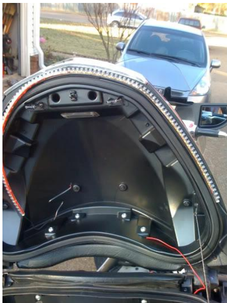
Right side done.