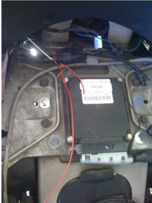
(Fig. 5) Hook your coat hanger onto your 3' piece of wire/string and pull it back up through the trunk. (Fig.5)